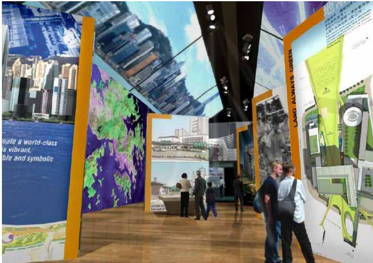
INTERIOR VIEW OF THE PROPOSED MULTI-USE EXHIBITION HALL (ARTIST'S IMPRESSIONS) 展覽館內多用途展區構思圖