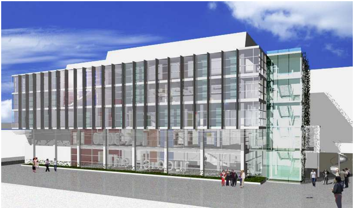
從西北面望向展覽館正面的構思圖 VIEW OF THE PROPOSED GALLERY FROM NORTH-WESTERN DIRECTION (ARTIST'S IMPRESSION)