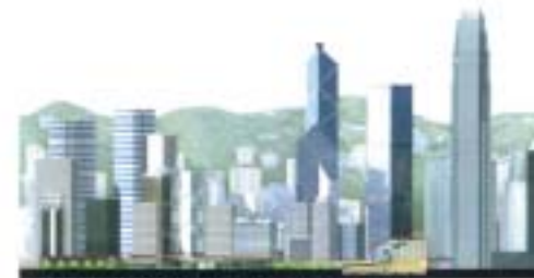
Section BB through CDA Site from IFC II to the harbourfront