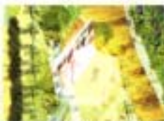
Outdoor Media Show and Performance Stage