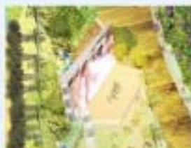
Outdoor media show and Performance stage 戶外媒體節目及表演場地