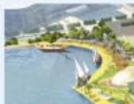
Marine Basin 海港內湖