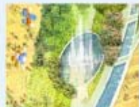
Musical fountain 音樂噴泉