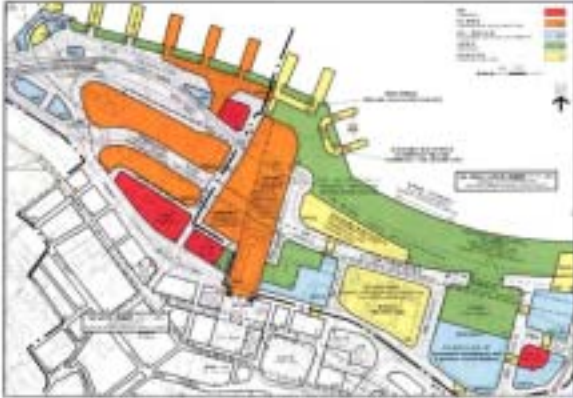
The approved Central District (Extension) OZP and Central District OZP (part)

The OZPs provide a land use framework for realizing the visions for the Victoria Harbour and creating a world-class waterfront that we can all be proud of.