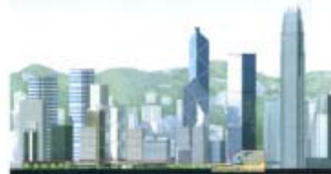
由國際金融中心第二期經過「綜合發展區」到海濱的橫切面BB'