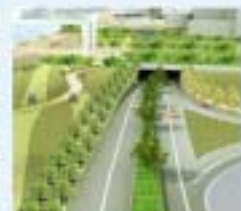
Tree-lined boulevard and at-grade landscaped deck 林蔭道路及地面園景平台