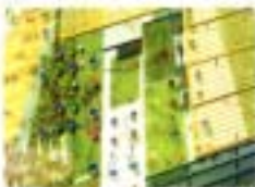
Alfresco Dining, Cafes & Outdoor Plaza on Timber Deck