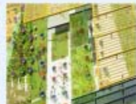
Alfresco dining, cafes and outdoor plaza on timber deck 露天茶座、餐廳 及在木板上的露天廣場