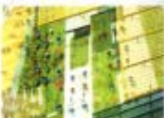
露天茶座、餐廳及在木橋上的露天廣場