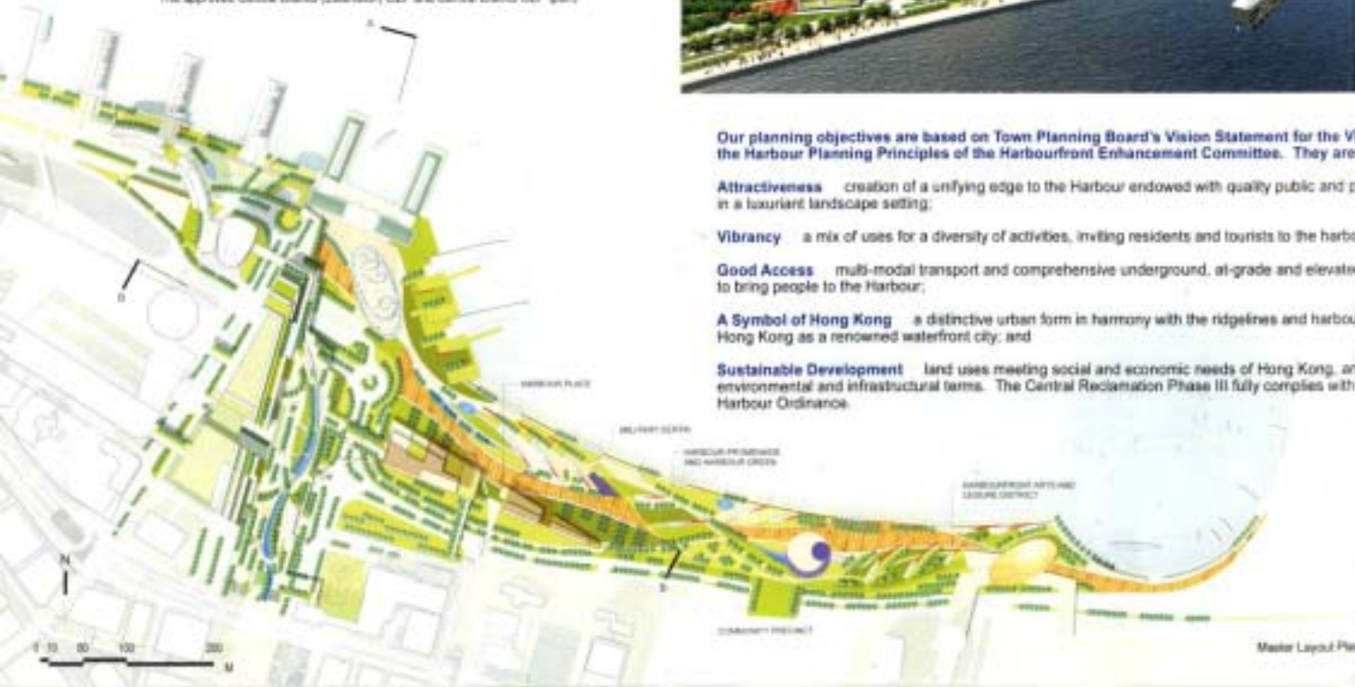
Master Layout Plan

Sustainable Development land uses meeting social and economic needs of Hong Kong, and sustainable in traffic, environmental and infrastructural terms. The Central Reclamation Phase III fully complies with the Protection of the Harbour Ordinance.