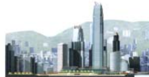
Section AA through CDA Site from Statue Square to New Star Ferry Pier