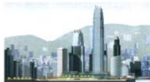
由皇后大道東經過「綜合發展區」至新天星小輪碼頭構成的橫切面AA'