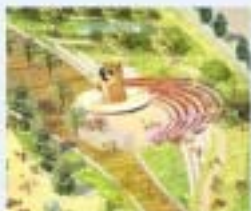
Amphitheatre and Outdoor forums 露天劇場及論壇場地