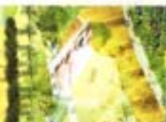
戶外媒體節目及表演場地