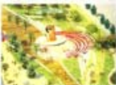
Amphitheatre and Outdoor Forums