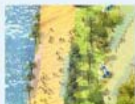
Harbour walkway 海濱走廊