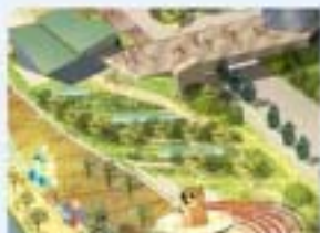
Undulating lawn 起伏有致的草坪