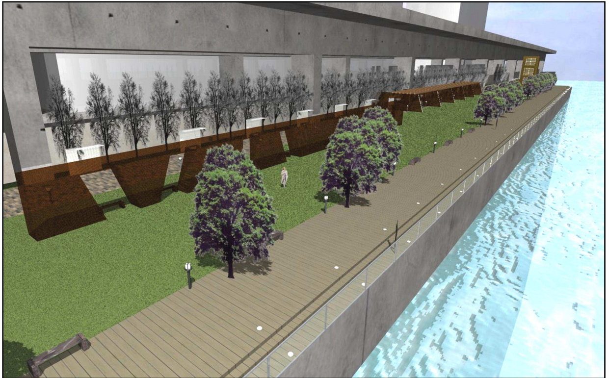
Overview from northwest with the lawn area and the seaside boardwalk in the foreground and Kwun Tong By-pass in the background.