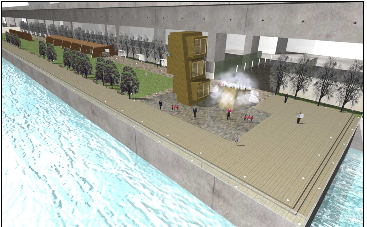
Overview from southeast with the entrance mist piazza and the feature light tower in the foreground.