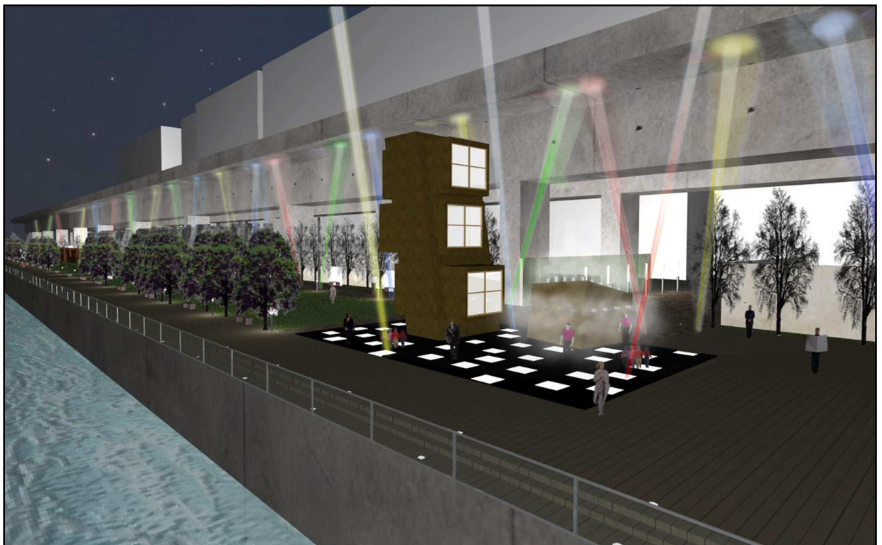
A nighttime attraction – Special lighting and mist effects adding vibrancy and interest.